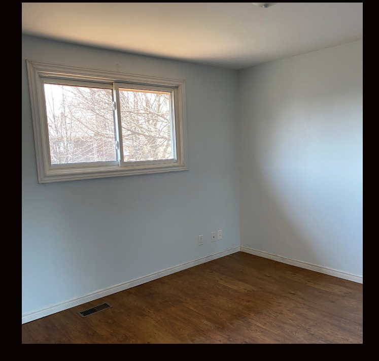
BEFORE 33 JUNIPER STREET, CAMBRIDGE