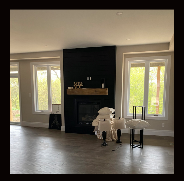
BEFORE 425 KEESO LANE, LISTOWEL

Professional Staging and Home Improvements | BY SIMPLICITY REAL ESTATE SERVICES + PROFESSIONAL STAGING