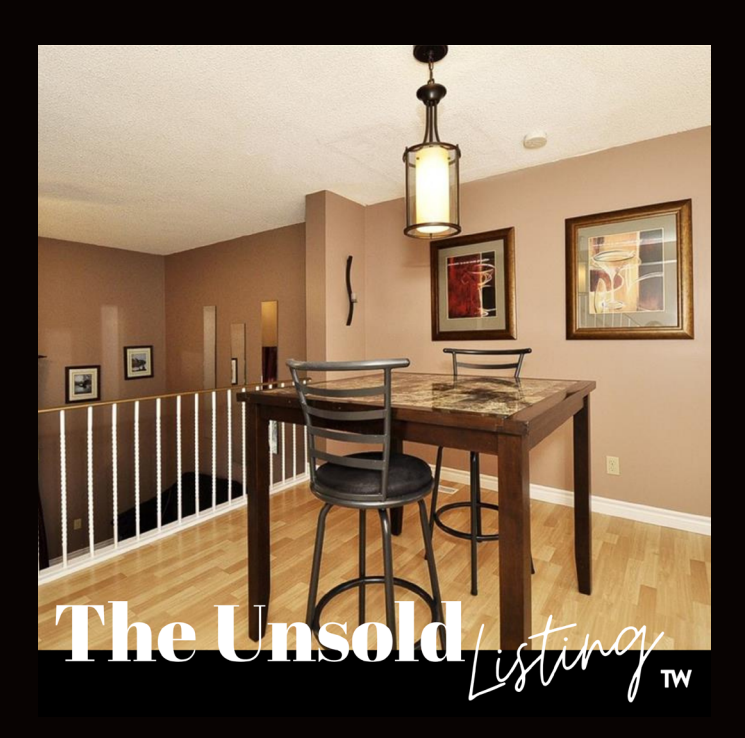
BEFORE 52 PAULANDER DRIVE, UNIT 102, KITCHENER