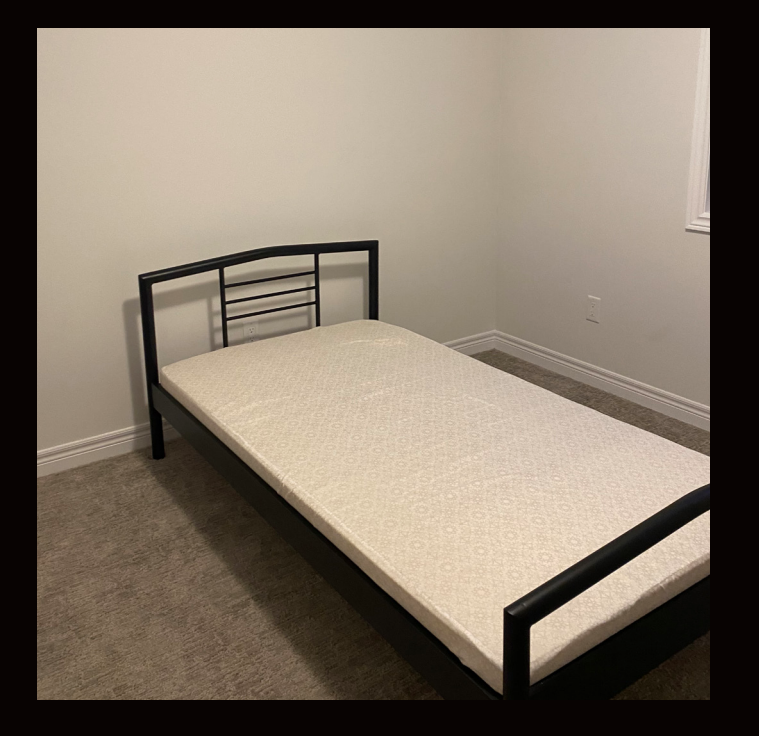
BEFORE 56 ARLINGTON PWY, PARIS