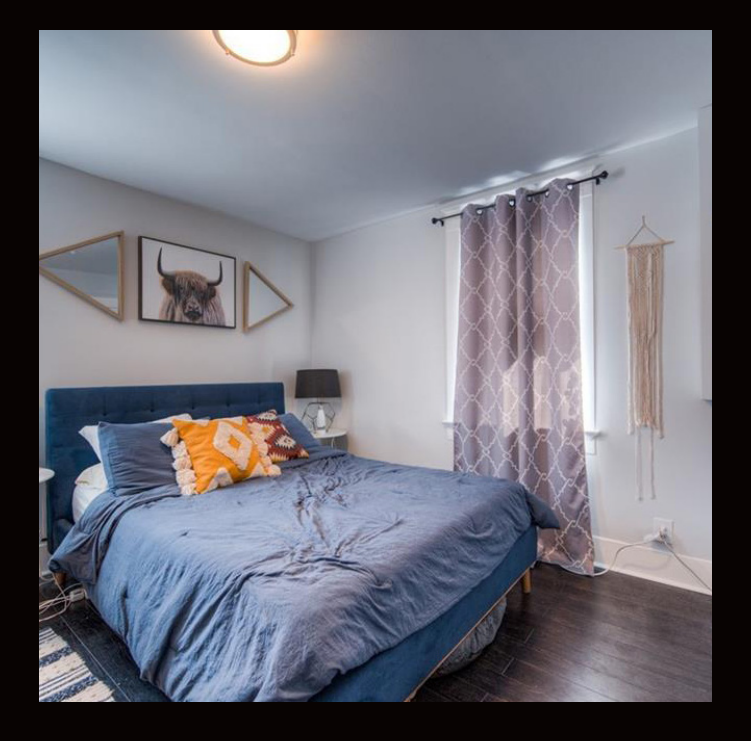
BEFORE 40 HEINS AVE, KITCHENER