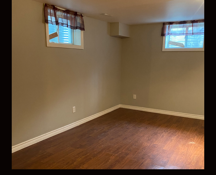
BEFORE 561 ALBERTA AVE, WOODSTOCK

Professional Staging and Home Improvements | BY SIMPLICITY REAL ESTATE SERVICES + PROFESSIONAL STAGING