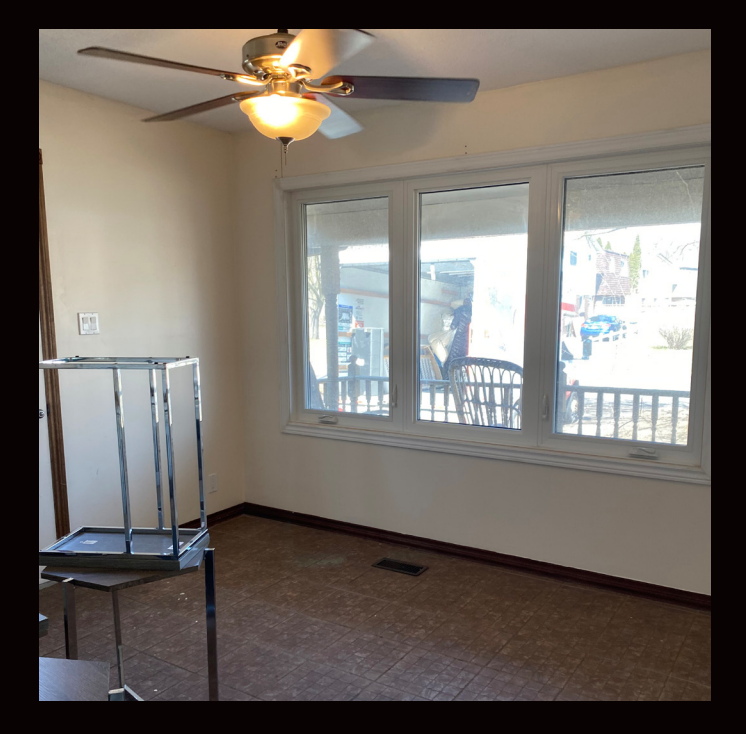
BEFORE 33 JUNIPER STREET, CAMBRIDGE