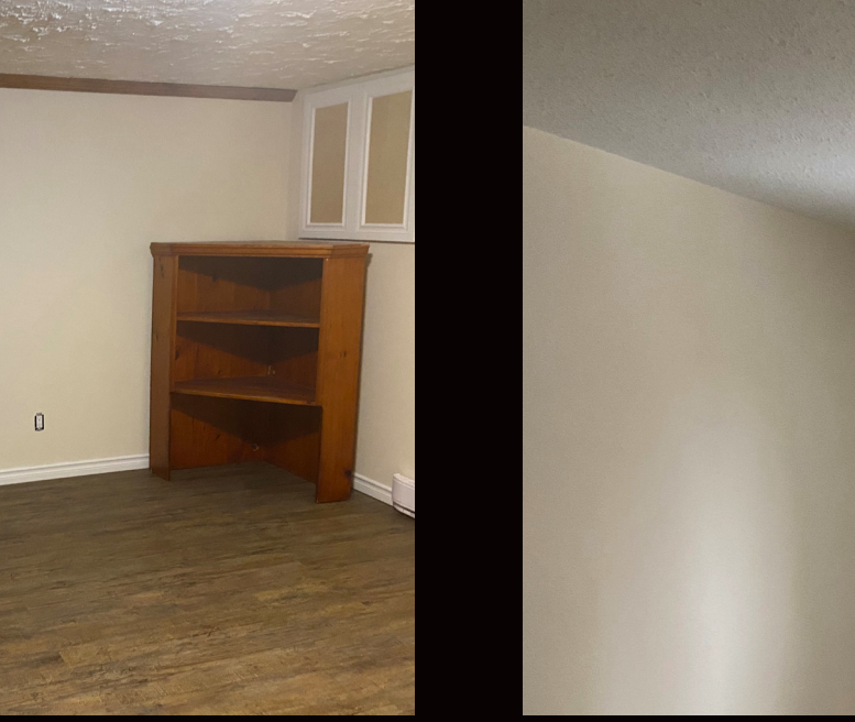
BEFORE 162 JANSEN AVE, KITCHENER

Professional Staging and Home Improvements | BY SIMPLICITY REAL ESTATE SERVICES + PROFESSIONAL STAGING