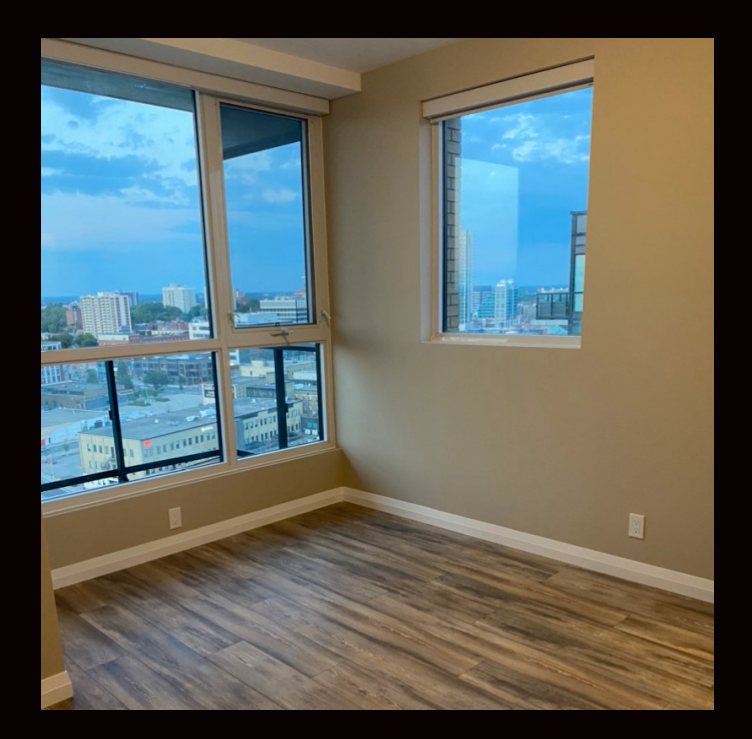
BEFORE 104 GARMENT ST, KITCHENER