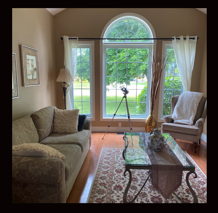
BEFORE 1268 MARYHILL RD, MARYHILL