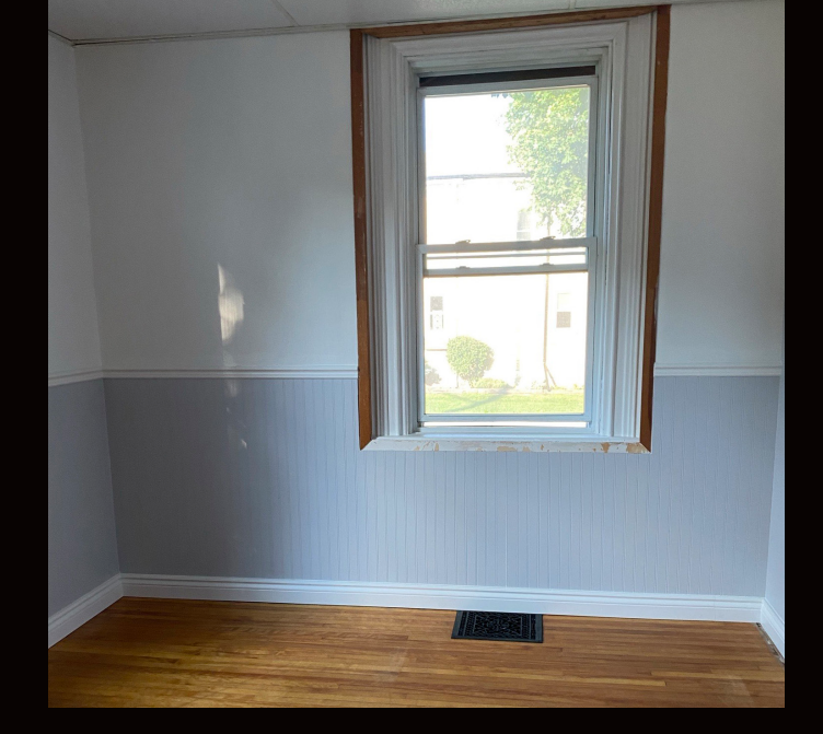
BEFORE 59 CEDAR ST, CAMBRIDGE