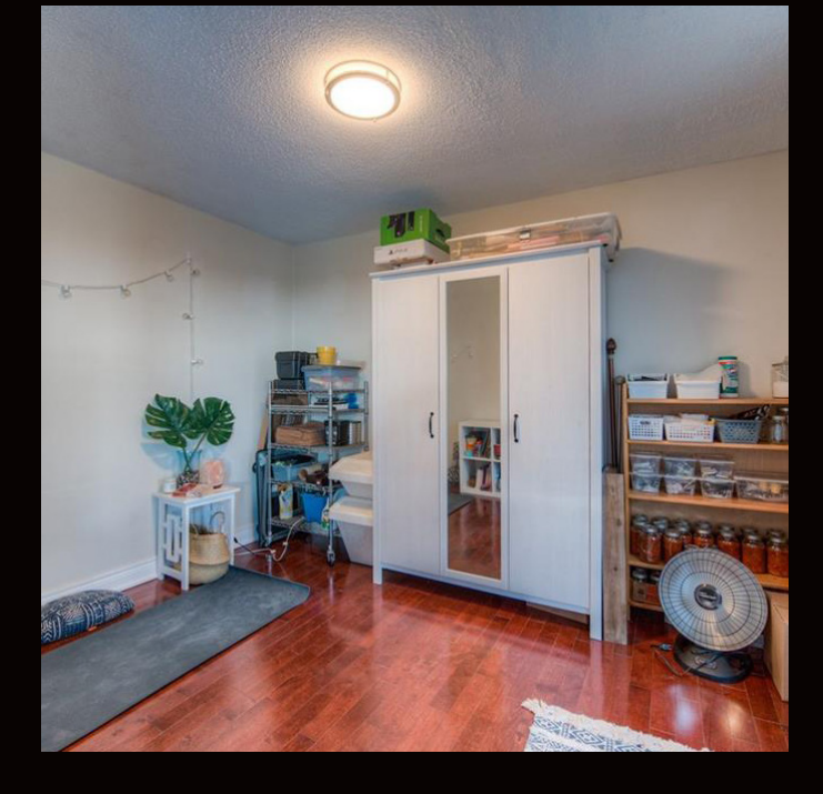
BEFORE 40 HEINS AVE, KITCHENER